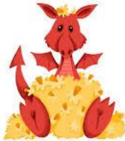
St. David day

01 March Patron Saint of Wales National flower: Daffodil