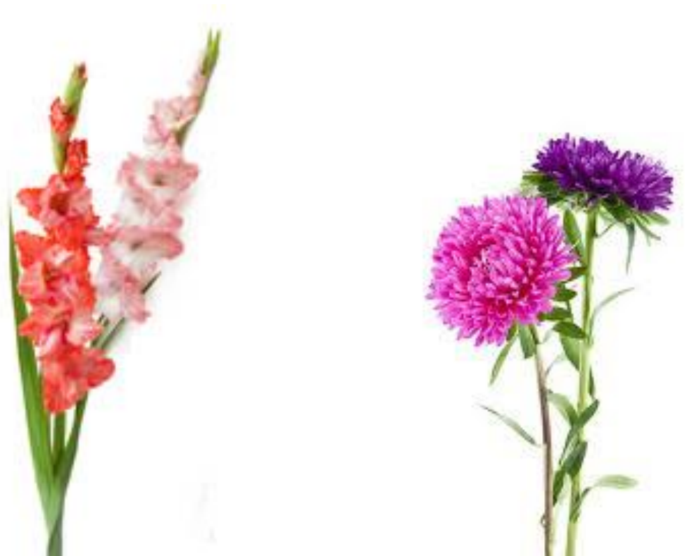
Gladioli - birth flower for August Aster - birth flower for September