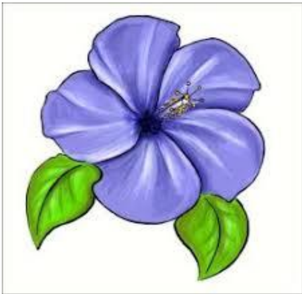
Violet – Birth Flower for February